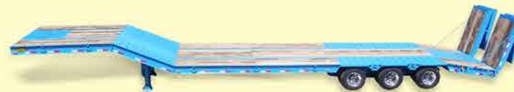
Model RN-52 with hydraulic bi-fold ramps