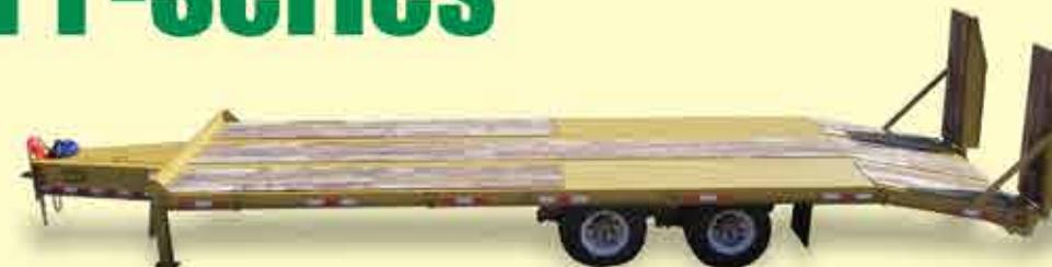
Model TT-20 with beaver tail and ramps