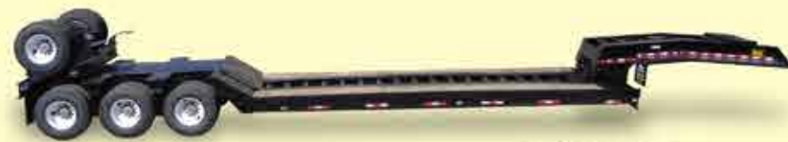
Model NGB-70 with optional flip axle and Gooseneck fenders