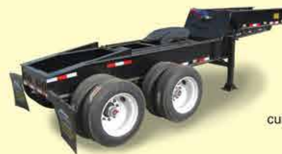
Jeep built to customer specifications