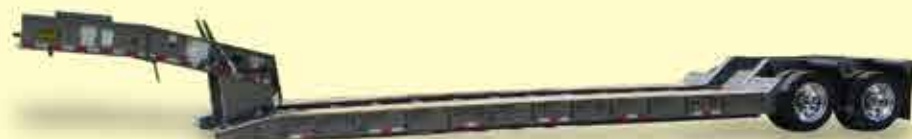
Model NGB-40 CS with optional aluminum wheels and KPRA compliant