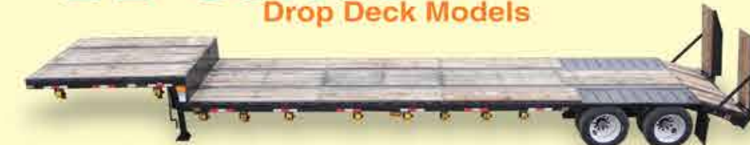
Model DD-40 with optional driver side sliding winches, beaver tail and ramps