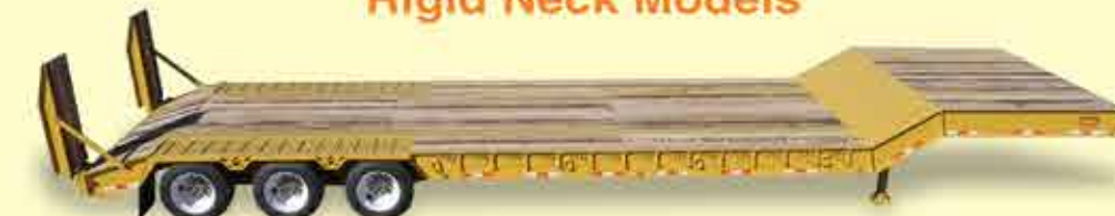
Model RN-50 Full width neck shown as 10' wide, with optional beaver tail and hydraulic ramps