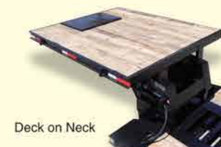
Deck on Neck