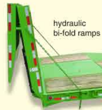
hydraulic bi-fold ramps