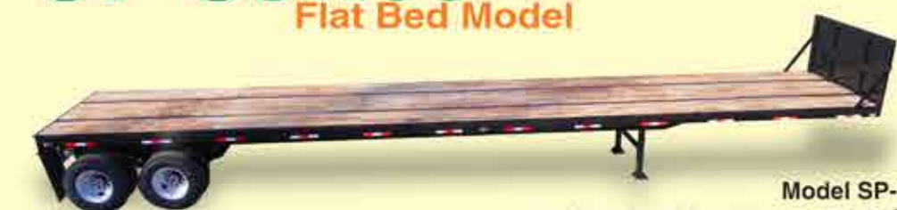
Model SP-35 with optional head board and 8 ISO twist locks for 20' & 40' containers