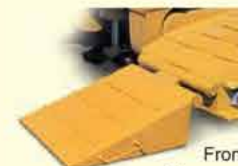
Front flip ramps

Rear Bucketwell with boom trough and diamond plate covered wheels