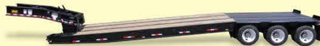
Model NGB-60 Paver